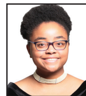
Alexandria Edison Eastern High School Hanover College