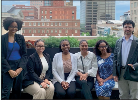
WYSP Scholars at Baird corporate office

Baird, one of Lincoln Foundation's valued corporate partners, recently hosted an open house to connect college