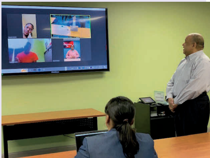
The new “Zoom Room”.

The Zoom Room was made possible thanks to the generous financial support from First Savings Charitable Foundation, The Honorable Order of Kentucky Colonels, and Old National Bank Foundation.