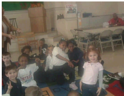
Students at the Portland Library Reading & Math Tutoring Program.

rights organizations, entertained foreign students from U of L's International Center, and supported "Clothe-A-Child" efforts. The Louisville Chapter has donated to Women's Health Initiative-WINGS, Metro United Way Book Harvest, Katrina hurricane victims, and the "Dress for Success" program. Members volunteer for Jefferson County Public Schools Every 1 Reads initiative and serve as speakers for the Lincoln Foundation's Whitney M. YOUNG Scholars Program®. The Girl Friends Fund, Inc. provides college scholarships to deserving youth. Two Whitney M. YOUNG Scholars received renewable scholarships in the amount of $1,500 in 2006 and 2007. Most recently, The Girl Friends, Inc. donated $375 to the Lincoln Foundation to help defray the cost of food for the after school reading and math tutoring program held at the Portland Library. This year the 73rd Annual Conclave of the Girl Friends, Inc. will convene in Louisville May 22 through May 25 at the Galt House Hotel.