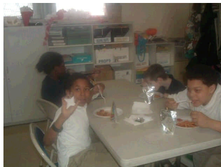
Students at the Portland Library enjoying a meal thanks to The Girl Friends, Inc.

rights organizations, entertained foreign students from U of L's International Center, and supported "Clothe-A-Child" efforts. The Louisville Chapter has donated to Women's Health Initiative-WINGS, Metro United Way Book Harvest, Katrina hurricane victims, and the "Dress for Success" program. Members volunteer for Jefferson County Public Schools Every 1 Reads initiative and serve as speakers for the Lincoln Foundation's Whitney M. YOUNG Scholars Program®. The Girl Friends Fund, Inc. provides college scholarships to deserving youth. Two Whitney M. YOUNG Scholars received renewable scholarships in the amount of $1,500 in 2006 and 2007. Most recently, The Girl Friends, Inc. donated $375 to the Lincoln Foundation to help defray the cost of food for the after school reading and math tutoring program held at the Portland Library. This year the 73rd Annual Conclave of the Girl Friends, Inc. will convene in Louisville May 22 through May 25 at the Galt House Hotel.