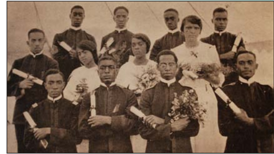
Lincoln Institute Class of 1916