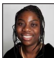
Cornelia St. Gerard Central High School Magnet Career Academy Jefferson Community & Technical College