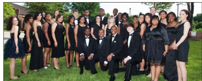
Whitney M. YOUNG Scholars Program® Class of 2010