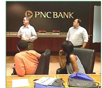
Students discuss banking with executives at PNC Bank.