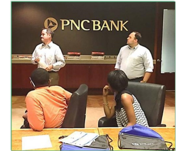
Students discuss banking with executives at PNC Bank.

Project BUILD was established in 1986 by Lincoln Foundation in partnership with BATUS Inc., Brown-Forman, GE, National City Bank and University of Louisville College of Business.